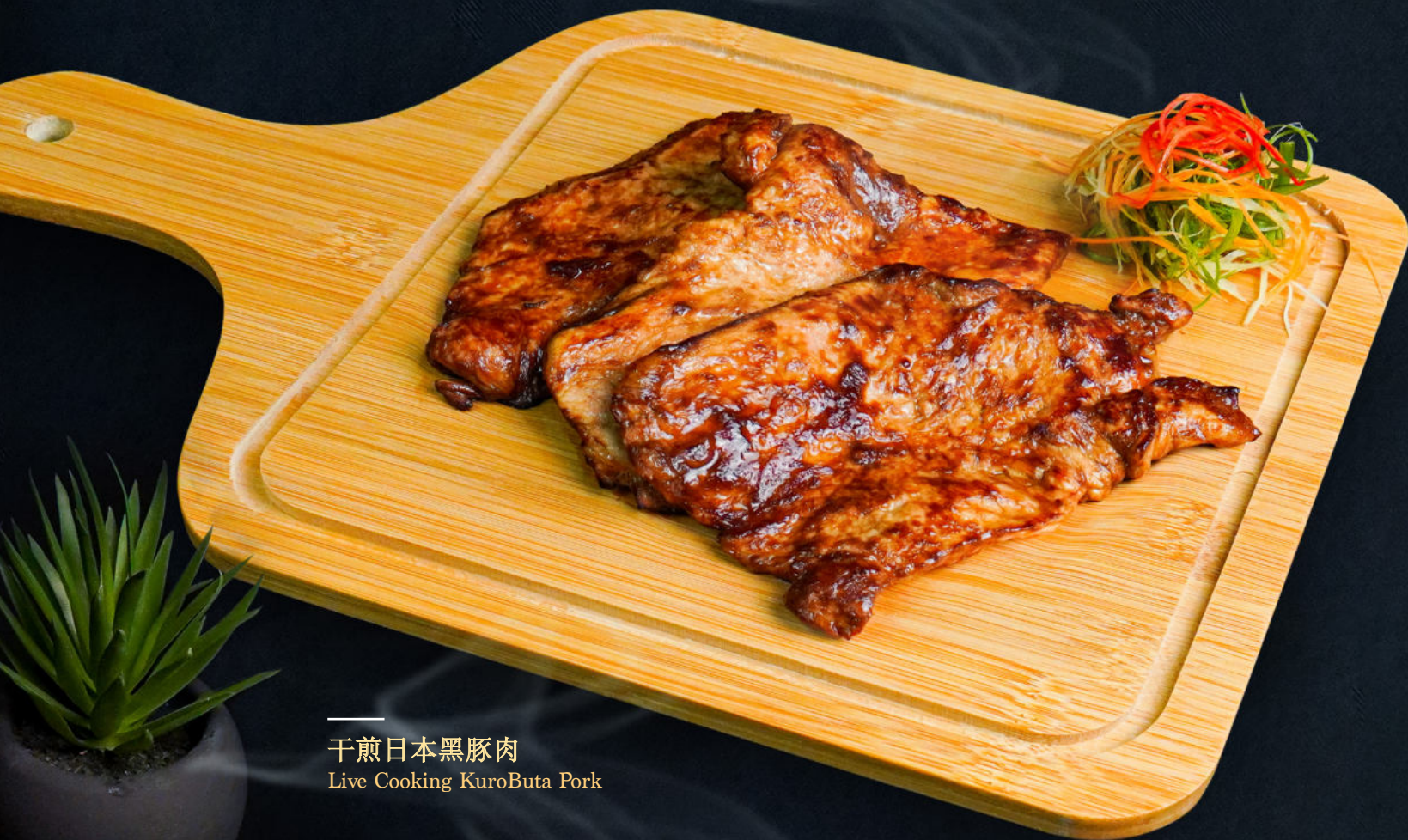
干煎日本黑豚肉 Live Cooking KuroButa Pork