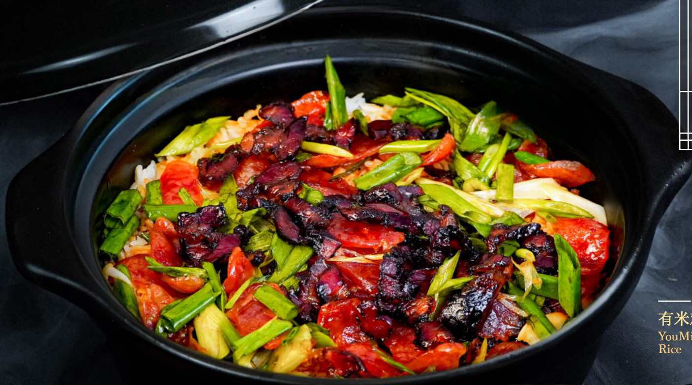
—— 有米鸡煲饭 YouMi Chicken Claypot Rice