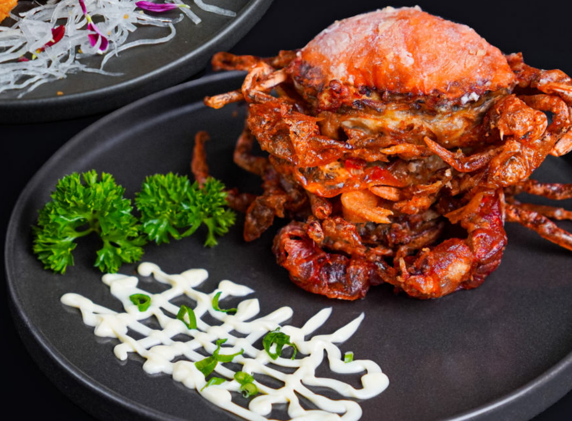
日本脆软壳蟹 Japanese Crispy Soft Shell Crab