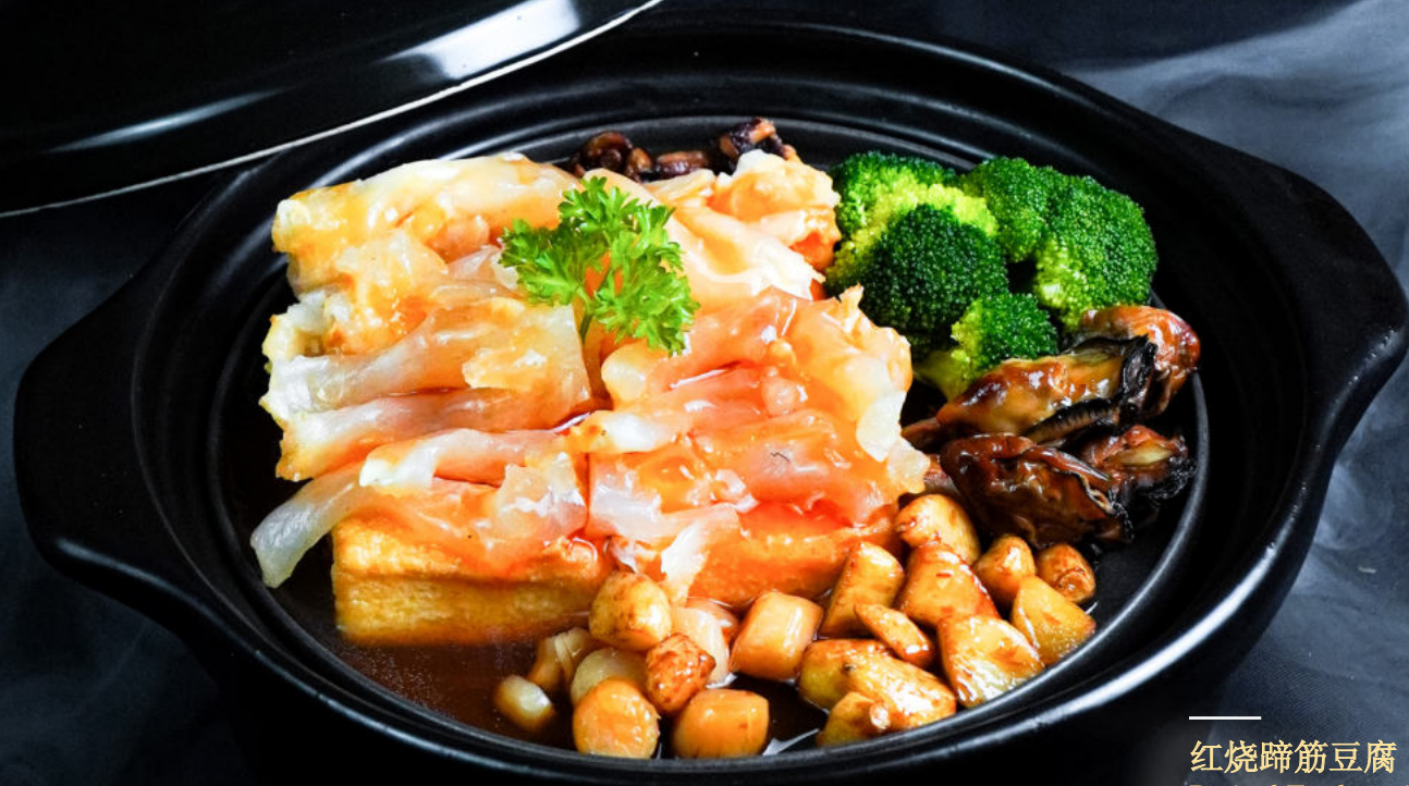
红烧蹄筋豆腐 Braised Tendon with Four Treasure