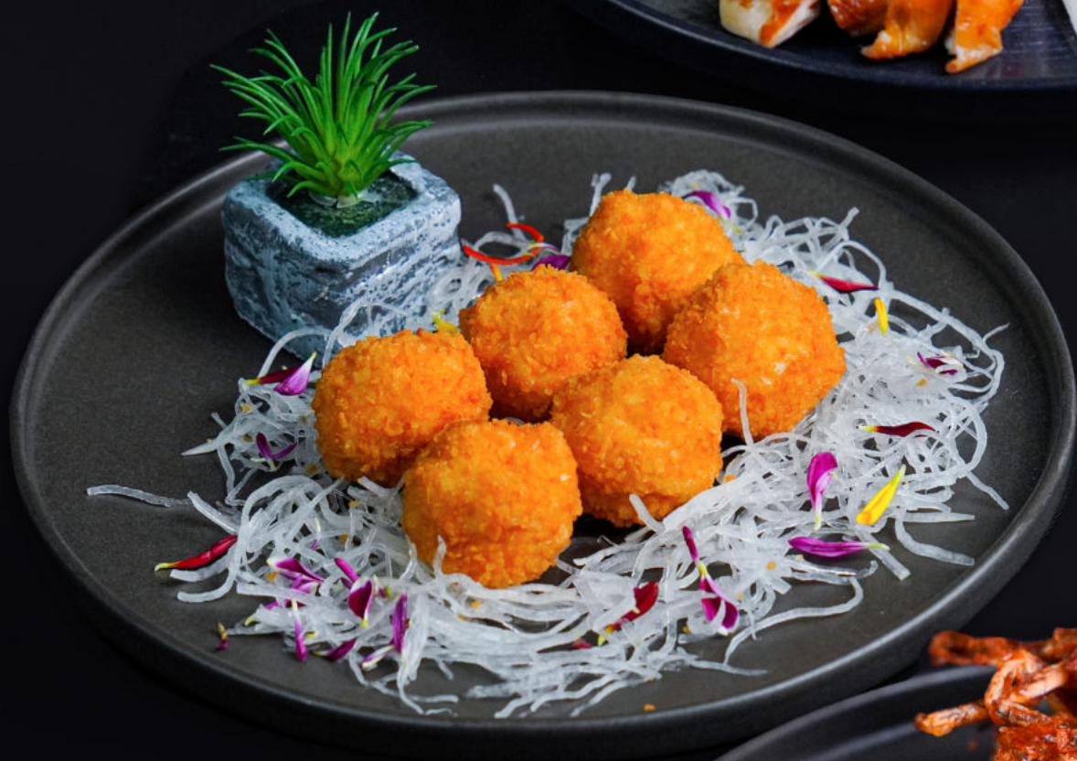
手工海鲜澳洲带子丸 Handmade Seafood Ball with Australia Scallops