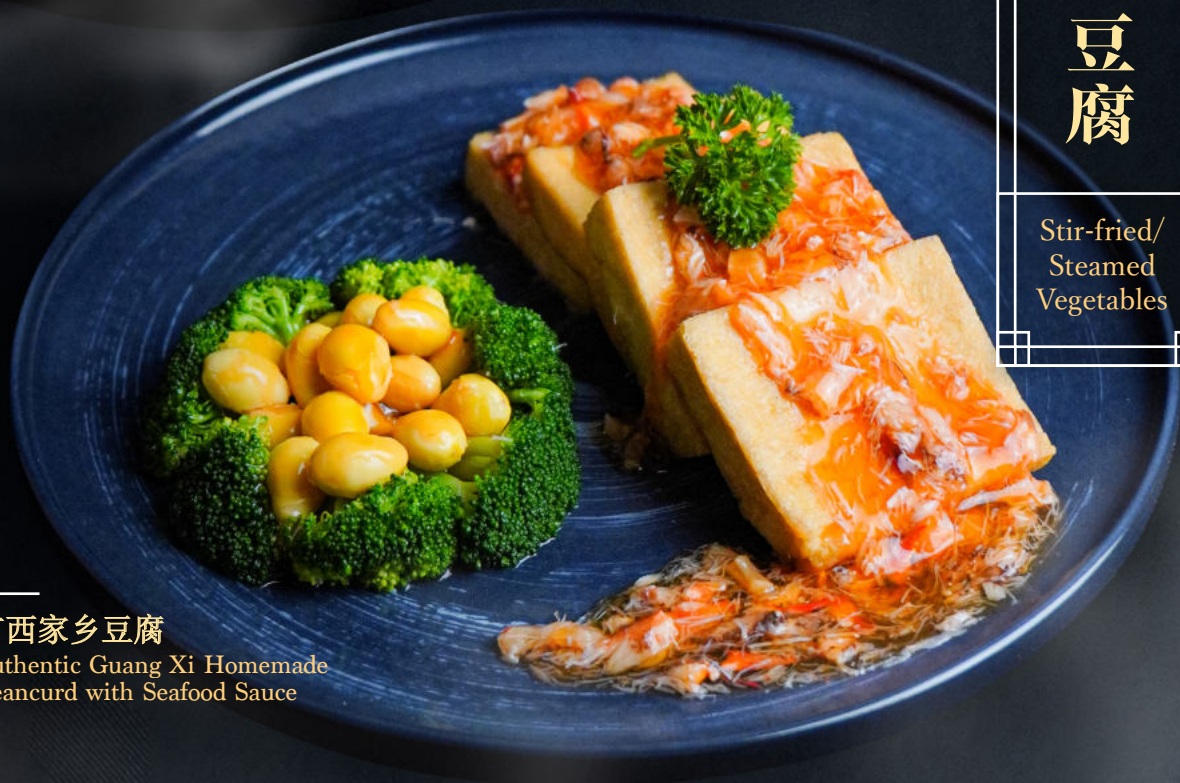
广西家乡豆腐 Authentic Guang Xi Homemade Beancurd with Seafood Sauce