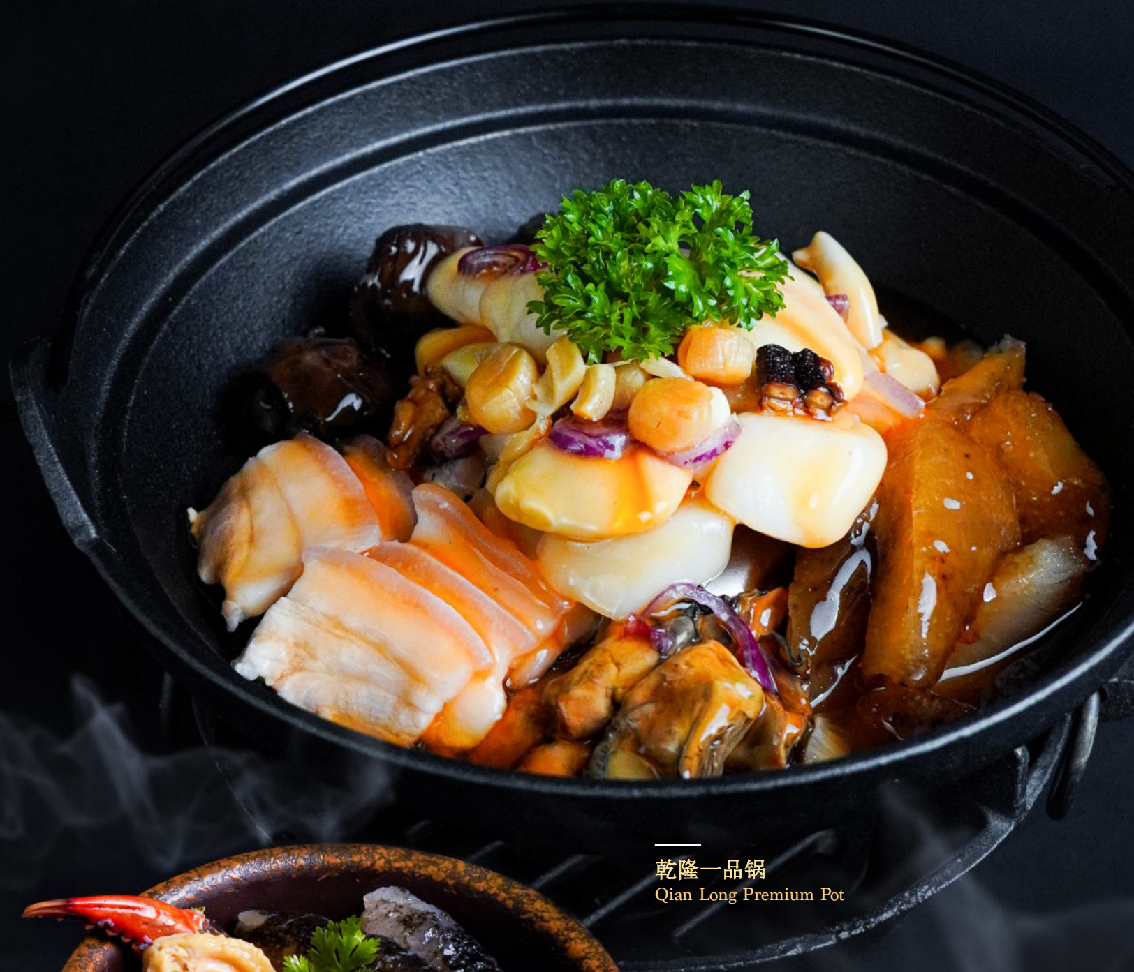
乾隆一品锅 Qian Long Premium Pot