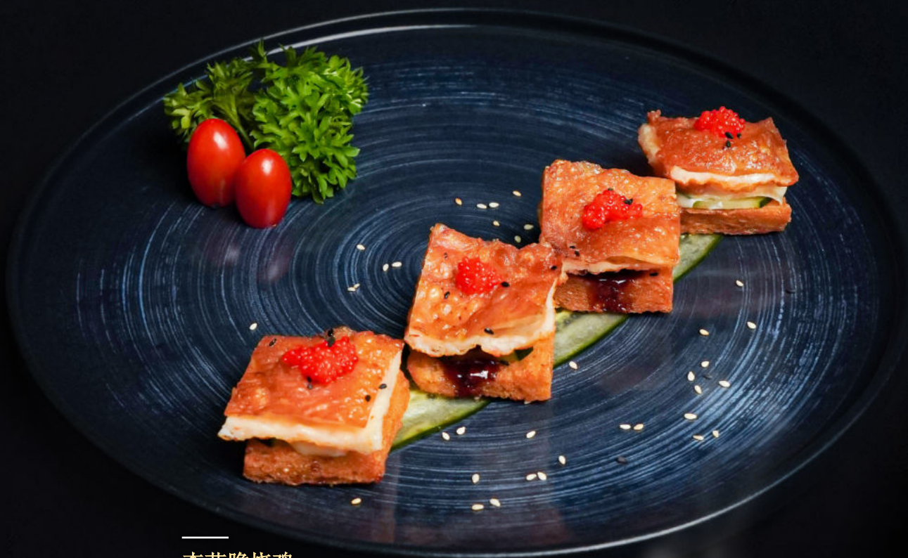
杏花脆烧鸡 Sliced Crispy Chicken with Pancake