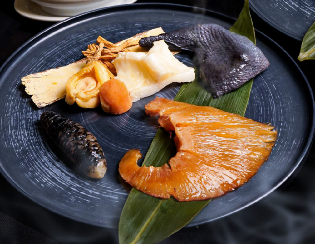
蟹皇烩鱼翅 Fish Fin with Crab Meat in Superior Soup