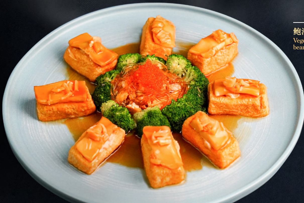
鲍汁翅豆腐 Vegetarian Fin Homemade beancurd with Abalone Sauce