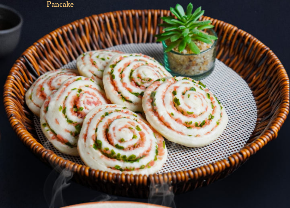
顺德手工葱油饼 Shunde Homemade Scallion Pancake