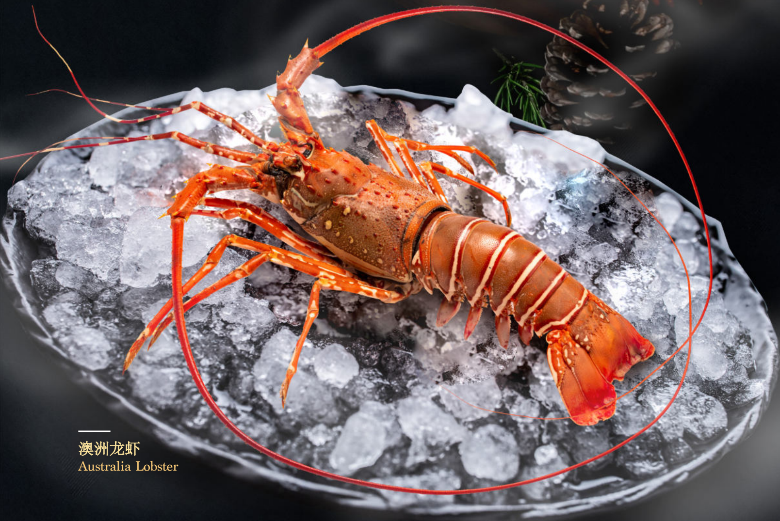
澳洲龙虾 Australia Lobster