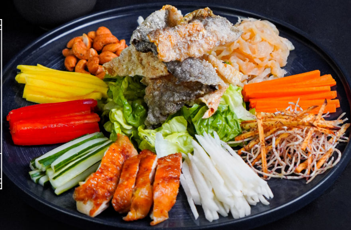
有米Fusion沙律 YouMiQi Fusion Salads