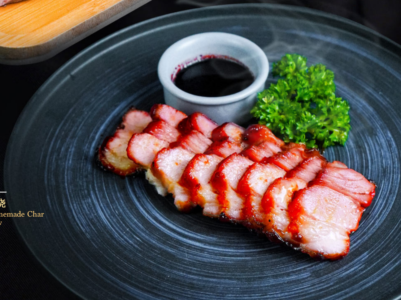
叉烧 Homemade Char Siew