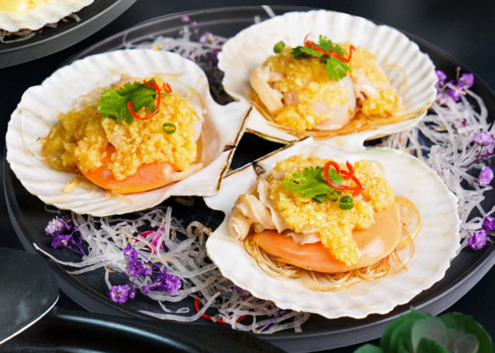
蒜蓉粉丝蒸扇贝 Steamed Fresh Scallop with Vermicelli