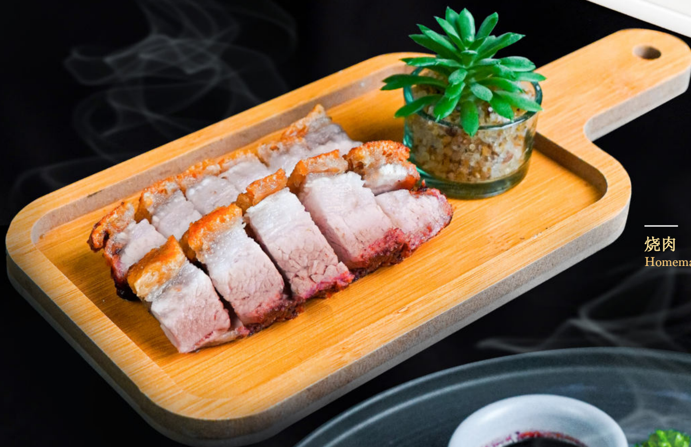
烧肉 Homemade Roasted Pork