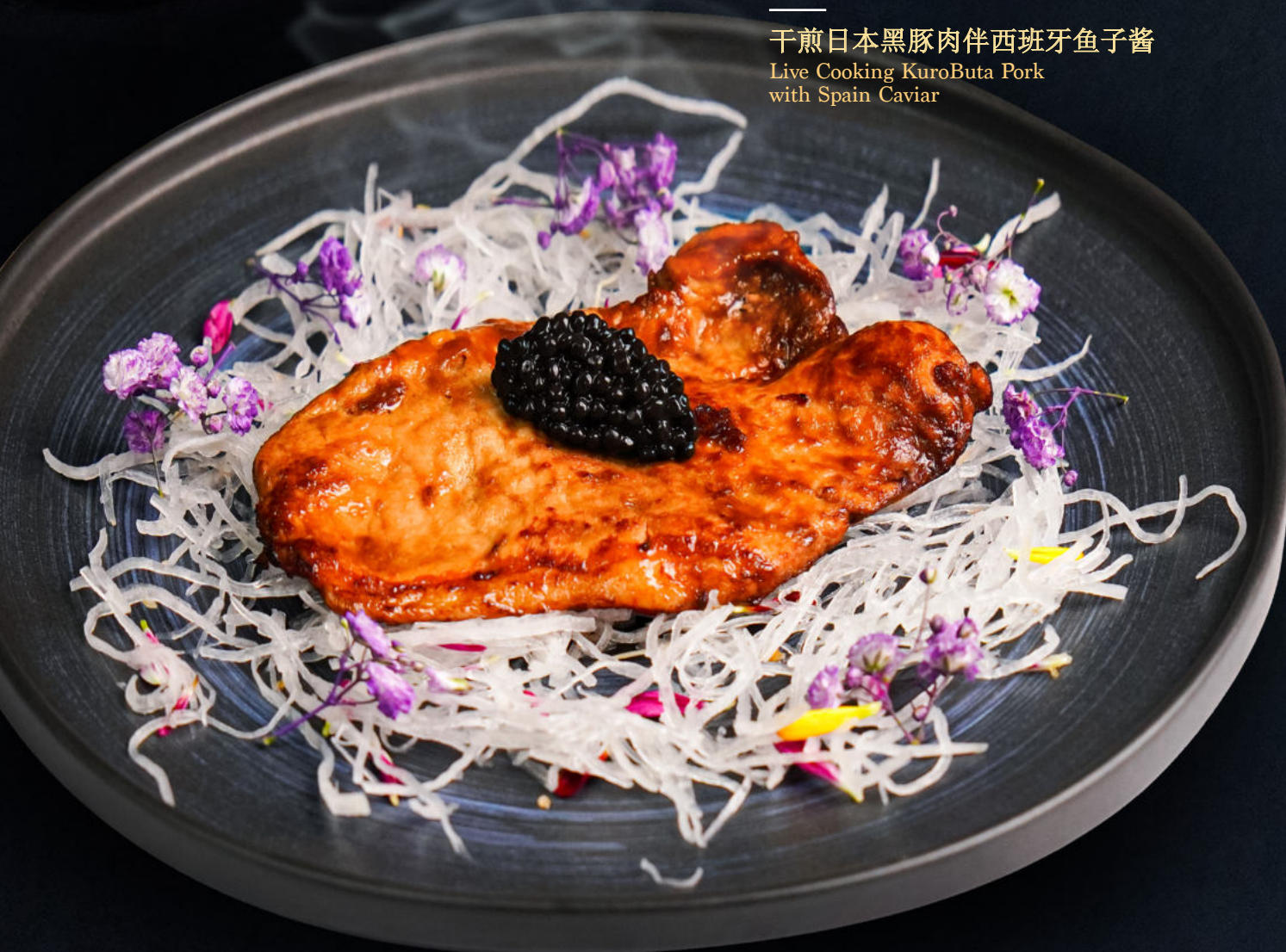
干煎日本黑豚肉伴西班牙鱼子酱 Live Cooking KuroButa Pork with Spain Caviar