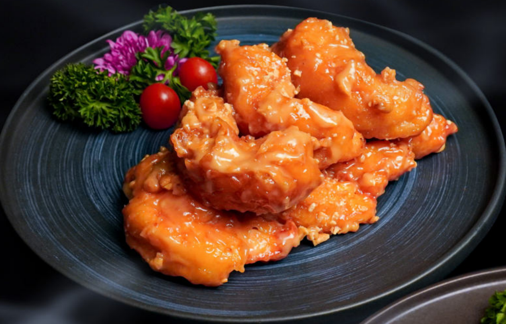
西汁虾球 Salad Prawn in Cantonese Style