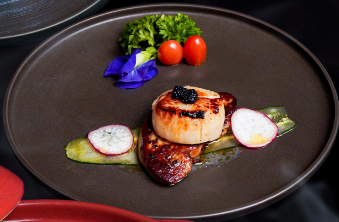
北海道带子鹅肝鱼子酱 Pan Fried Hokkaido Scallops with France Foigras and Caviar