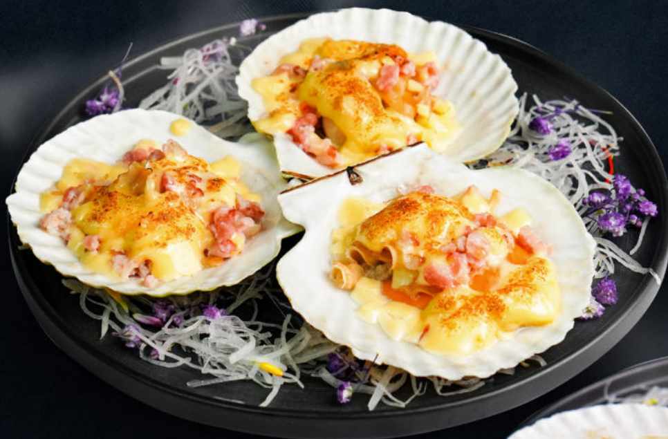
瑞士芝士焗日本大扇贝 Baked Fresh Scallop with Cheese