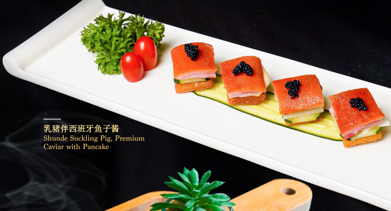
乳猪伴西班牙鱼子酱 Shunde Suckling Pig, Premium Caviar with Pancake