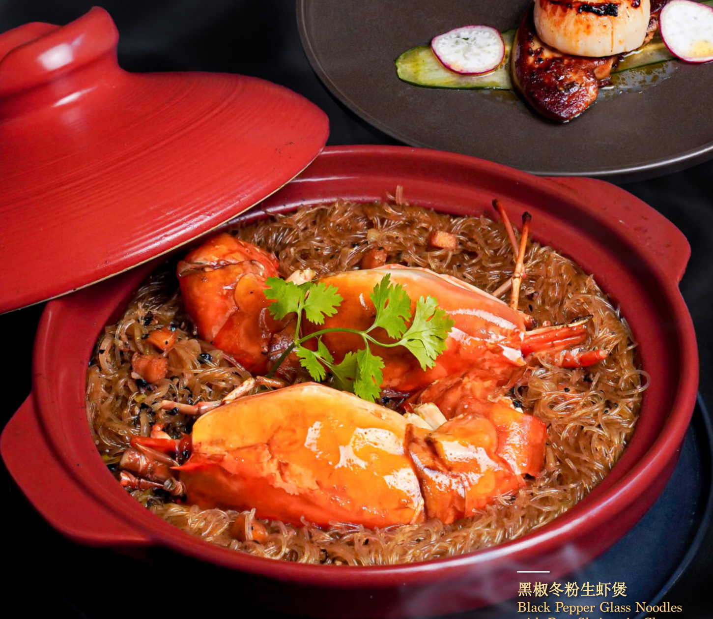
黑椒冬粉生虾煲 Black Pepper Glass Noodles with Raw Shrimp in Claypot