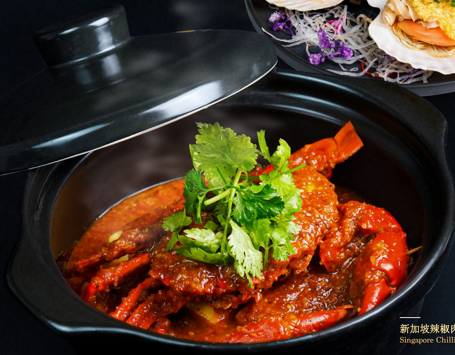
新加坡辣椒肉蟹 Singapore Chillies Crab