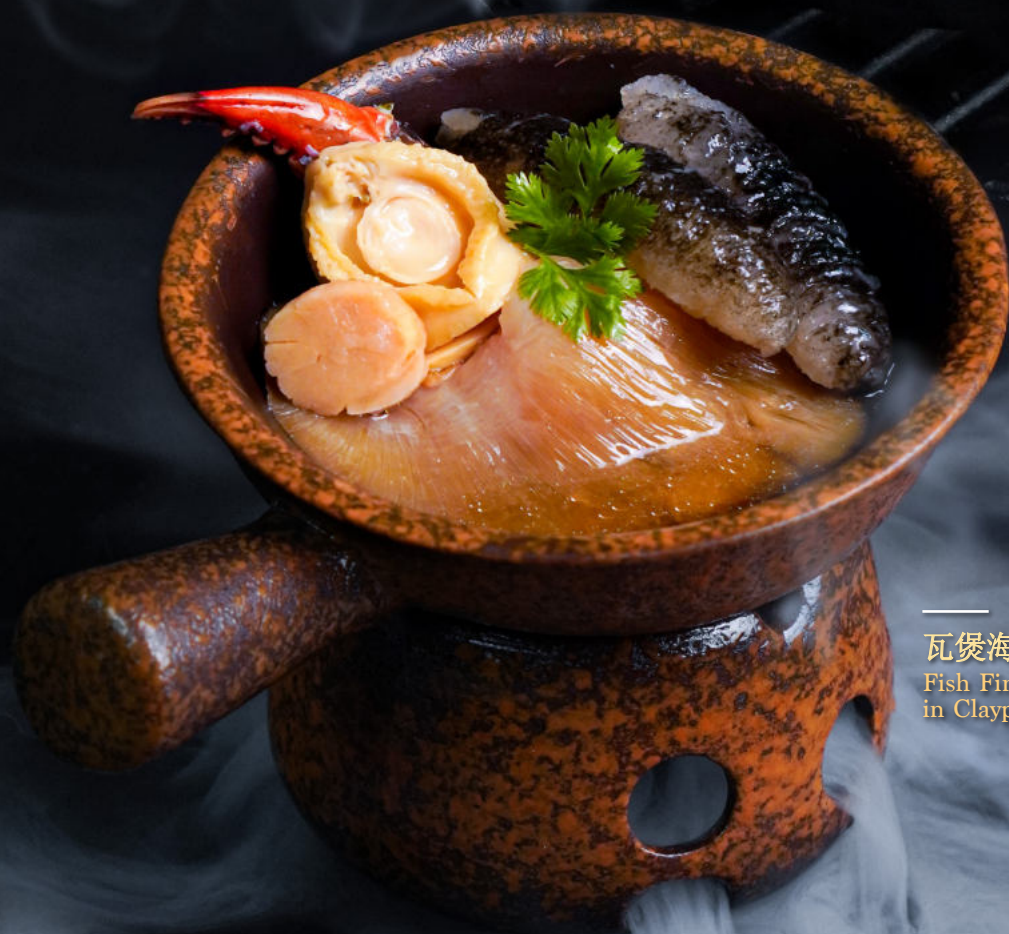
瓦煲海味煲翅 Fish Fin with Dried Seafood in Claypot