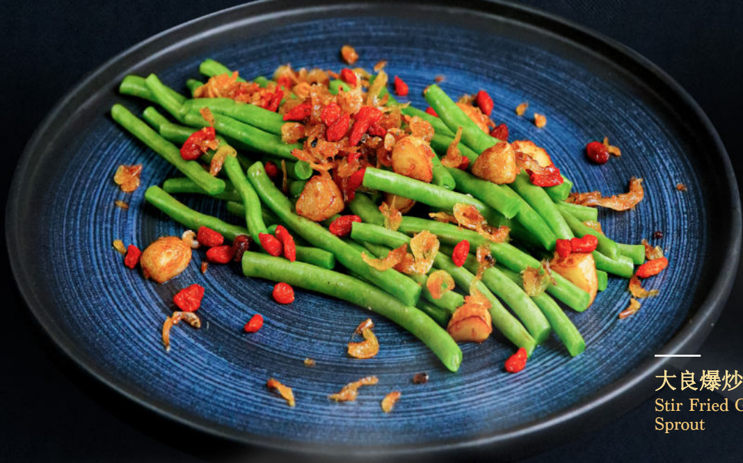
大良爆炒季豆苗 Stir Fried Green Bean Sprout