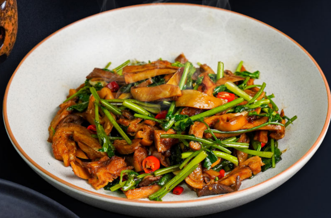
湖南爆炒肚丝 Hunnan Wok Fried Intestine