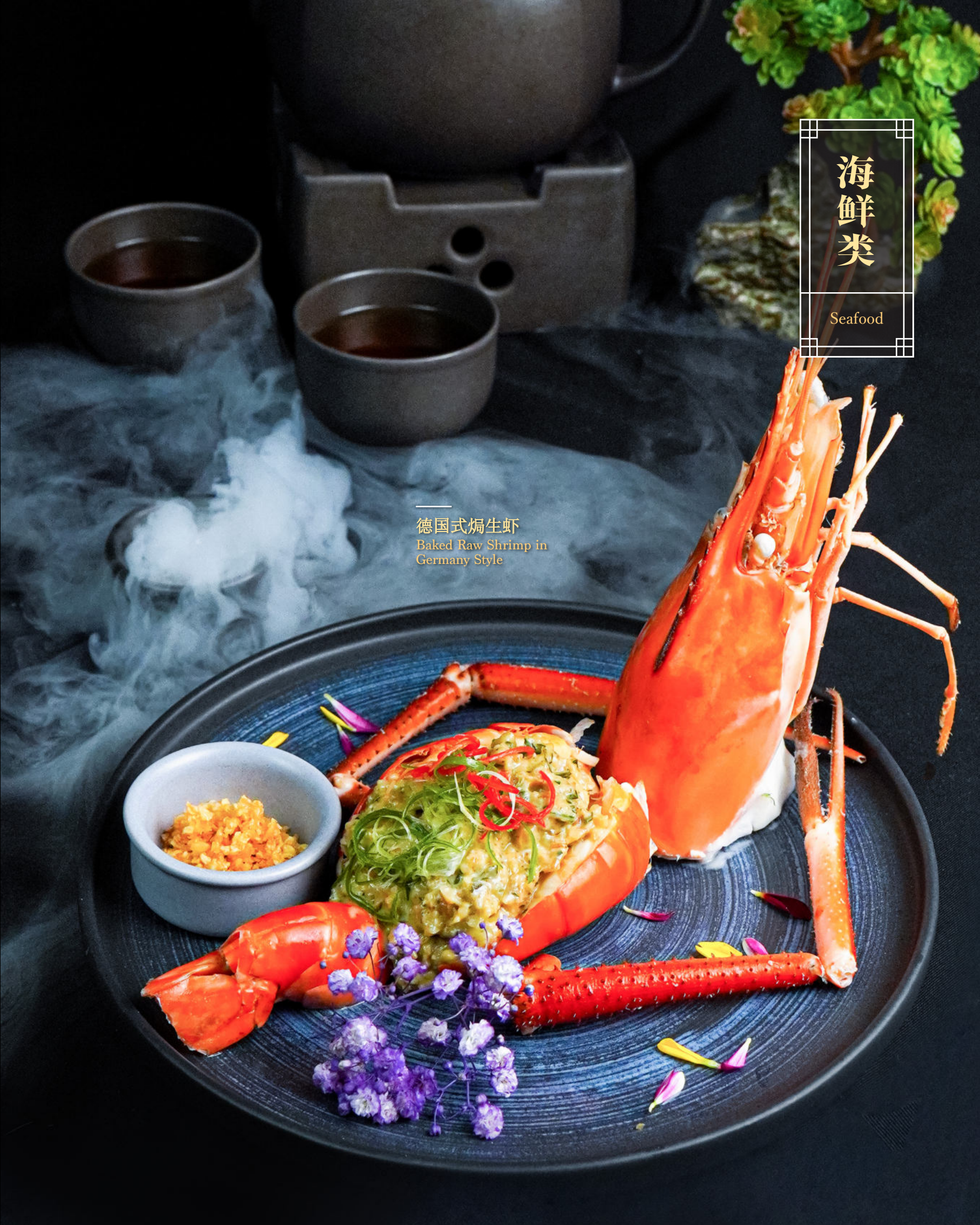
德国式焗生虾 Baked Raw Shrimp in Germany Style