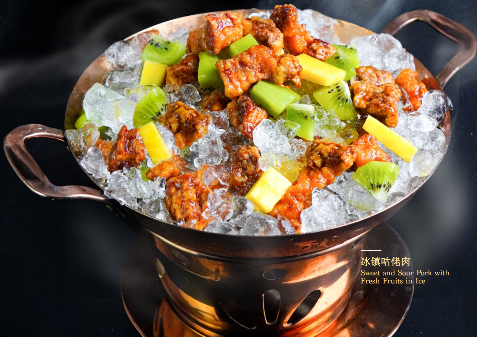
冰镇咕佬肉 Sweet and Sour Pork with Fresh Fruits in Ice