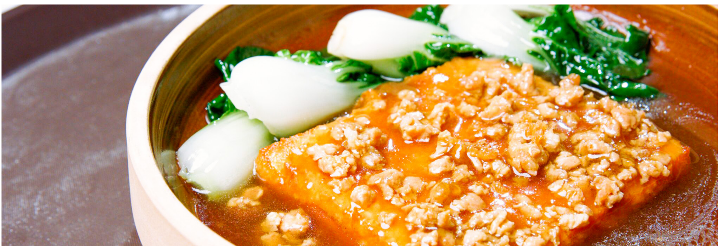
▲ BC6. 肉碎小炳豆腐 Stir Fried Beancurd with Minced Pork RM20.00