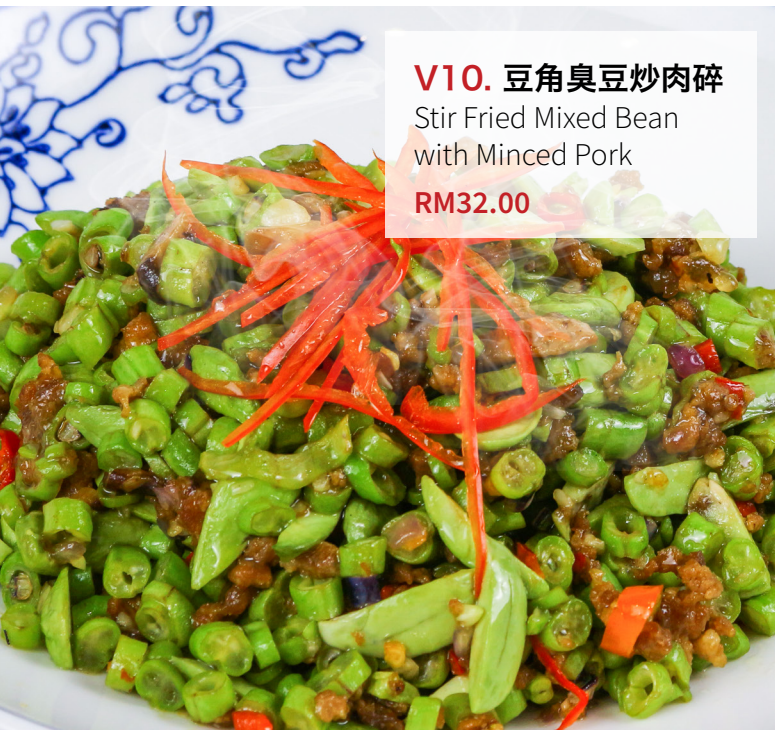
V10. 豆角臭豆炒肉碎 Stir Fried Mixed Bean with Minced Pork RM32.00