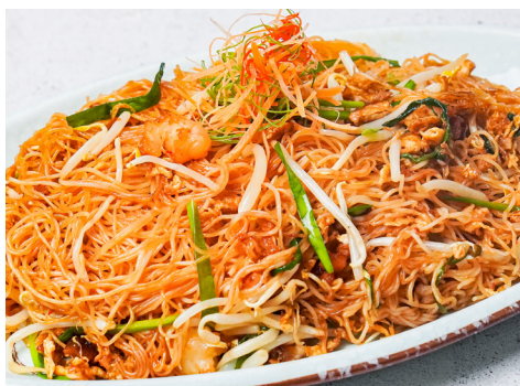
▲ N3. 星州炒米粉 Singapore Fried Bihun RM15.00