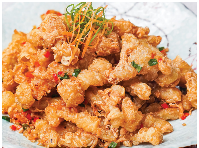
▲ S11. 椒盐炸白松菇 Salt and Pepper Fried Shimeji Mushroom RM18.00

All prices are subject to 5% service charge and 6% government tax.