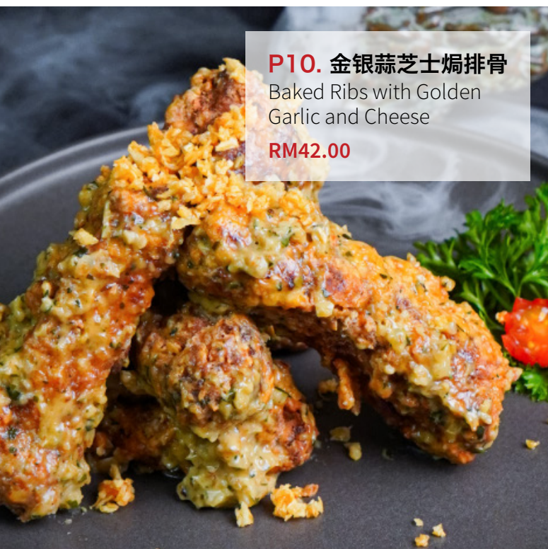
P10. 金银蒜芝士焗排骨 Baked Ribs with Golden Garlic and Cheese RM42.00