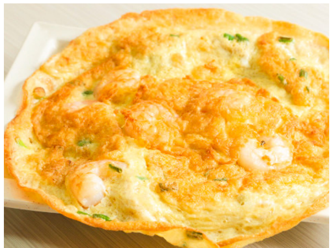
▲ E3. 芙蓉蛋 Foo Yong Egg RM20.00