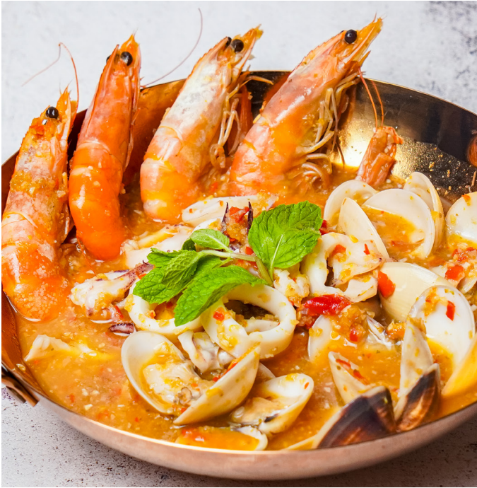
▲ L7. 柠檬金牌三鲜煲 Mixed Seafood Pot with Hot and Sour Soup RM68.80