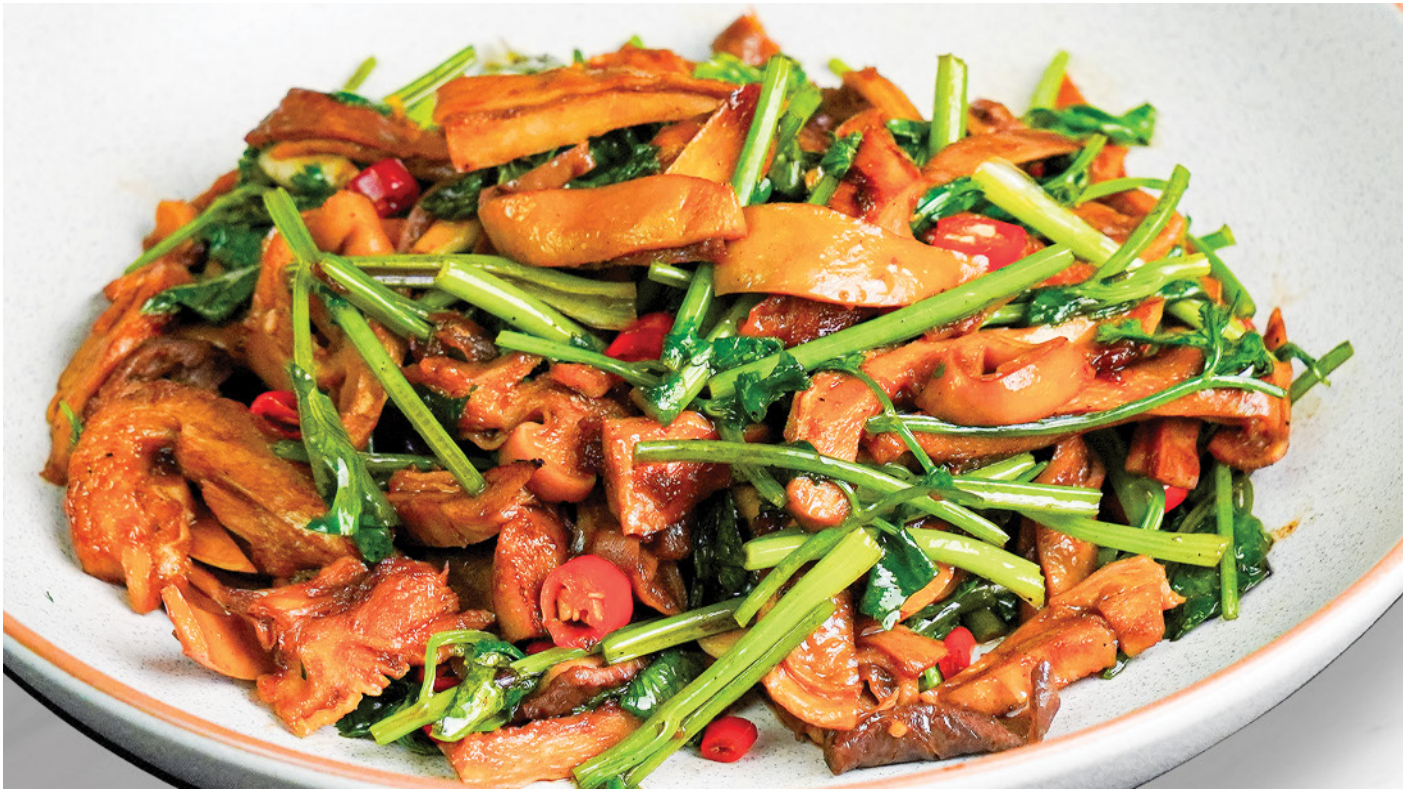
▲ S9. 爆炒猪肚丝 Wok Fried Pork Intestine RM28.00