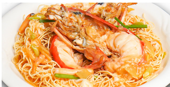
▲ N6. 生虾双面王 Crispy Egg Noodles with King Prawn RM68.80