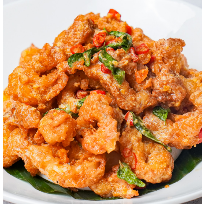
▲ L8. 咸蛋苏东 Crispy Squid with Salted Egg Yolk RM35.00