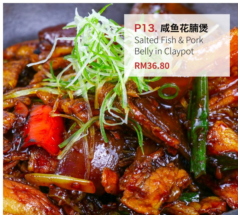
P13. 咸鱼花腩煲 Salted Fish & Pork Belly in Claypot RM36.80