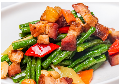
▲ V6. 豆角炒烧肉 Stir Fried Roasted Pork with Long Beans RM38.00