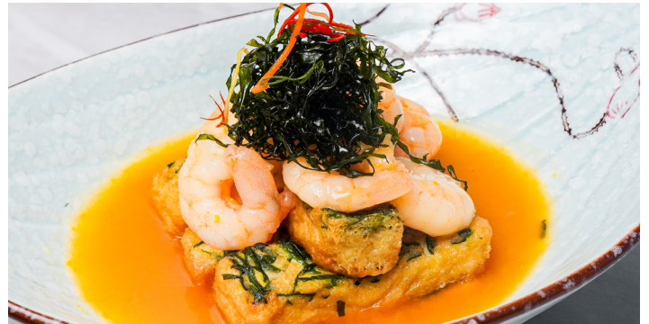
▲ BC3. 金瓜虾仁豆腐 Homemade Beancurd with Shrimp and Pumpkin Sauce RM28.00