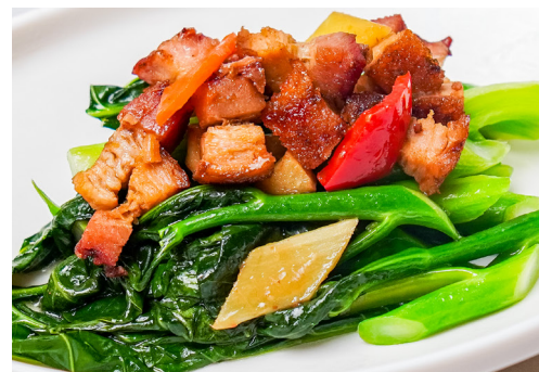
▲ V7. 芥兰炒烧肉 Stir Fried Roasted Pork with Gai Lan RM38.00