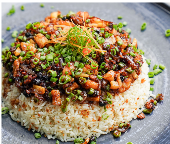
▲ R6. 香港大茶饭 👍 Hong Kong Brother Fried Rice RM48.80