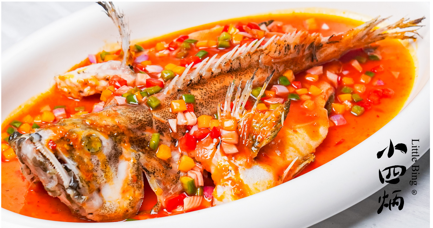
▲ F7. 酸甜鱼 Sweet and Sour Fish Market Price