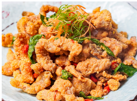
▲ PR9. 咸蛋虾羔肉 Crispy Mantis Prawn with Salted Egg Yolk RM32.80