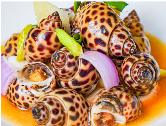
▲ BS2. 姜葱炒花螺 Wok Fried Babylon Shell with Ginger and Onion RM42.00