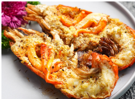
▲ PR8. 德式焗大生虾 Germany Style Baked King Prawn RM68.80