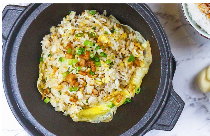
◀ R5. 蒜香炒饭 👍 Signature Garlic Fried Rice RM20.80