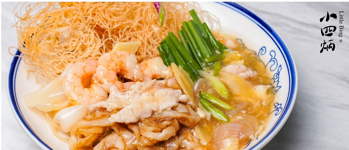
▲ N1. 广府鸳鸯 Cantonese Yuen Yong with Silky Egg RM15.00