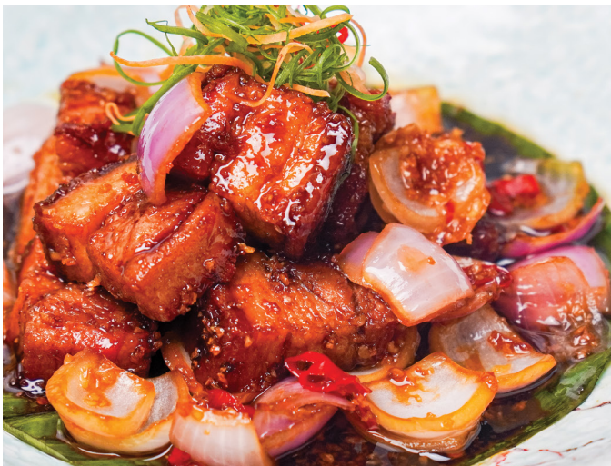
▲ S10. 火爆烧肉 Stir Fried Pork Belly RM32.00