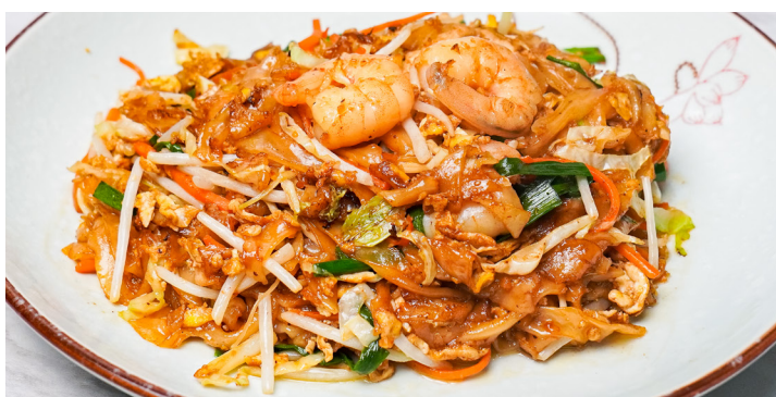
▲ N5. 干炒河粉 Stir Fried Hor Fun RM15.00