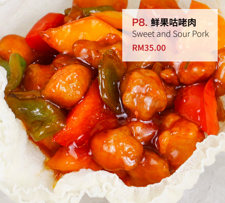
P8. 鲜果咕咾肉 Sweet and Sour Pork RM35.00