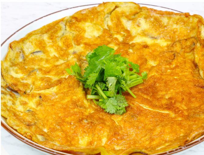
▲ E2. 洋葱煎蛋 Onion Omelette RM20.00