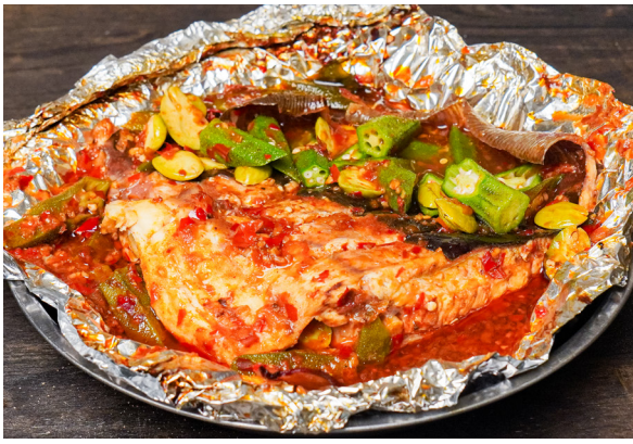
▲ F3. 葡萄牙烧鱼 Portuguese Grilled Fish RM62.80 (Siakap or Stingray) 500g