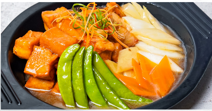
▲ BC1. 红烧豆腐 Braised Homemade Beancurd RM32.00