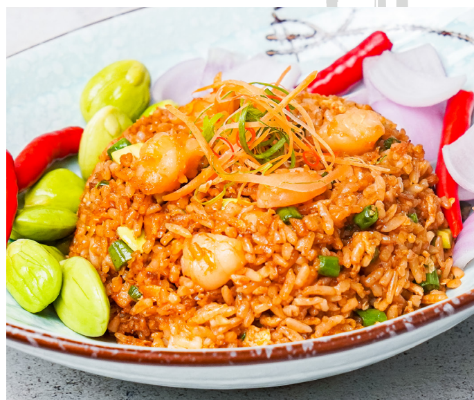
▲ R7. 甘帮炒饭 Kampung Fried Rice RM15.00