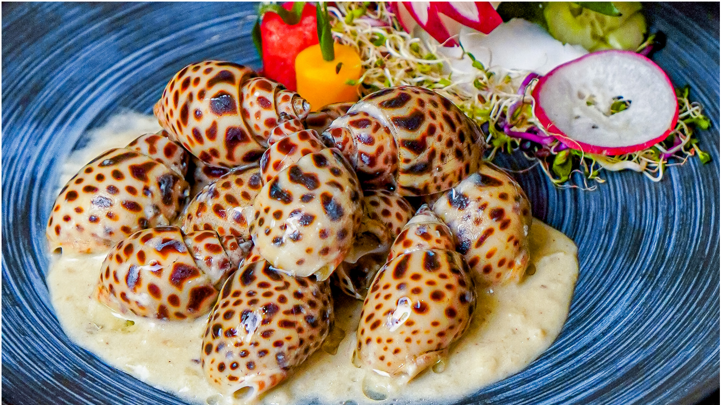
▲ BS1. 法国白汁焗花螺 France White Sauce Baked Babylon Shell RM42.00