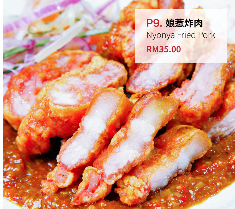
P9. 娘惹炸肉 Nyonya Fried Pork RM35.00