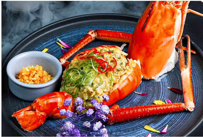
▲ PR6. 瑞士芝士焗生虾 Swiss Cheese Baked King Prawn RM68.80