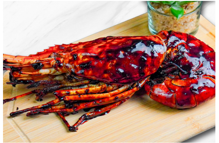
▲ PR7. 酱油皇焗大生虾 Pan Fried King Prawn with Dark Soy Sauce RM68.80