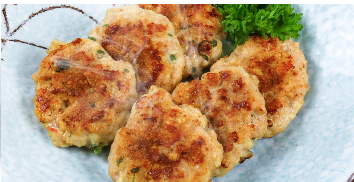
◀ P6. 莲藕煎肉饼 Pan Fried Minced Pork with Salted Fish RM30.00