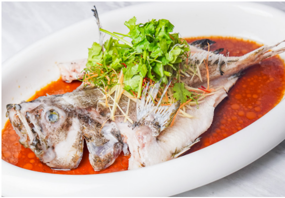
▲ F4. 清蒸鱼 Steamed Fish with Superior Soy Sauce Market Price