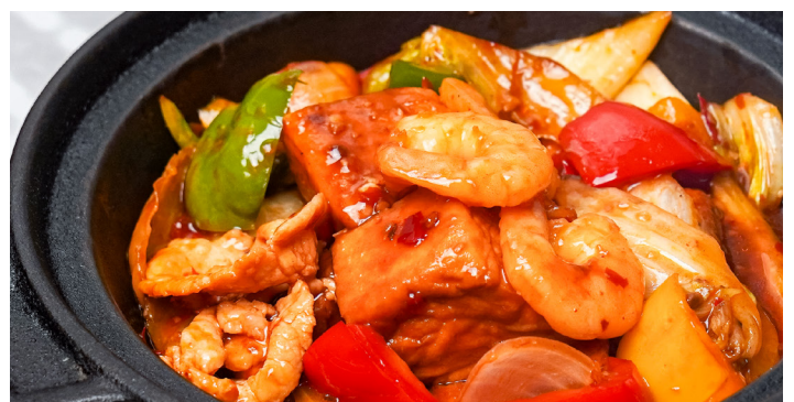
▲ BC5. 家常豆腐 Homemade Beancurd with Prawn and Roasted Pork RM42.00