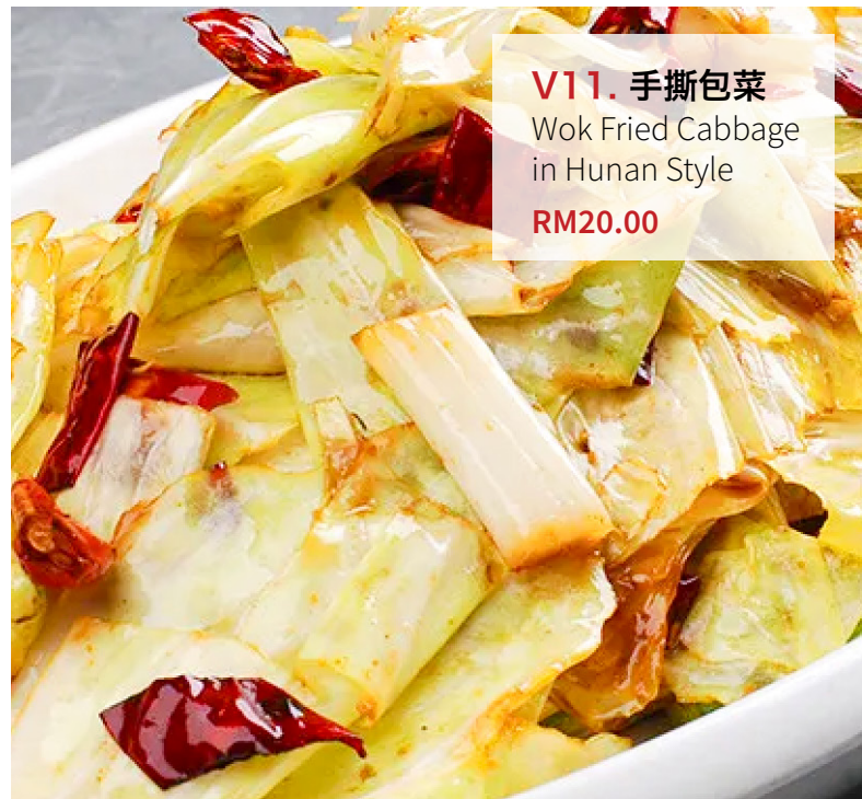
V11. 手撕包菜 Wok Fried Cabbage in Hunan Style RM20.00