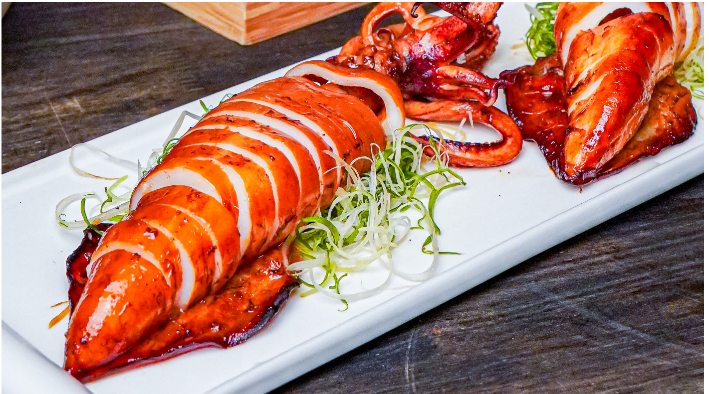
▲ L9. 日式鱿鱼筒 Grilled Japanese Squid Tube RM38.00