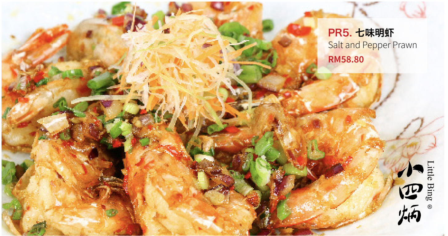
PR5. 七味明虾 Salt and Pepper Prawn RM58.80