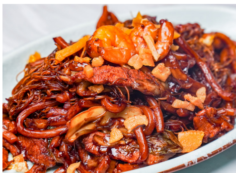
▲ N2. 福建米粉面 Hokkien Bihun Mee RM15.00