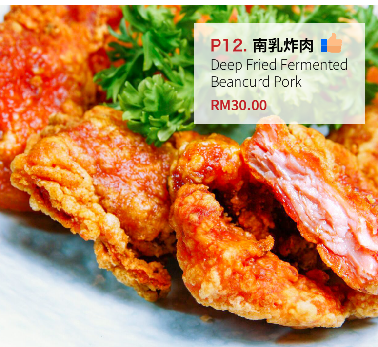
P12. 南乳炸肉 🍗 Deep Fried Fermented Beancurd Pork RM30.00