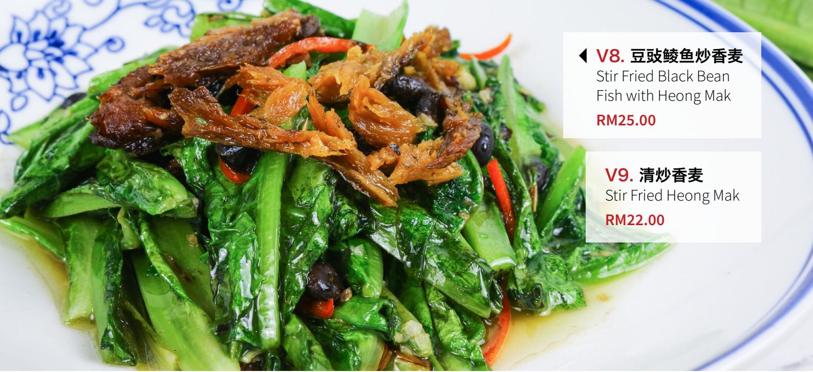
◀ V8. 豆豉鲮鱼炒香麦 Stir Fried Black Bean Fish with Heong Mak RM25.00