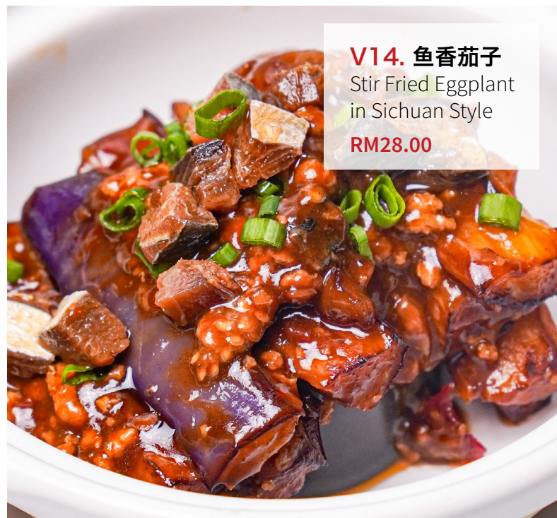
V14. 鱼香茄子 Stir Fried Eggplant in Sichuan Style RM28.00