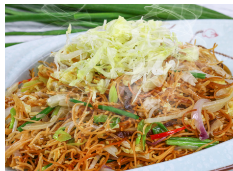
▲ N4. 小炳炒面线 Special Wok Fried Hokkien Mee Sua RM20.80