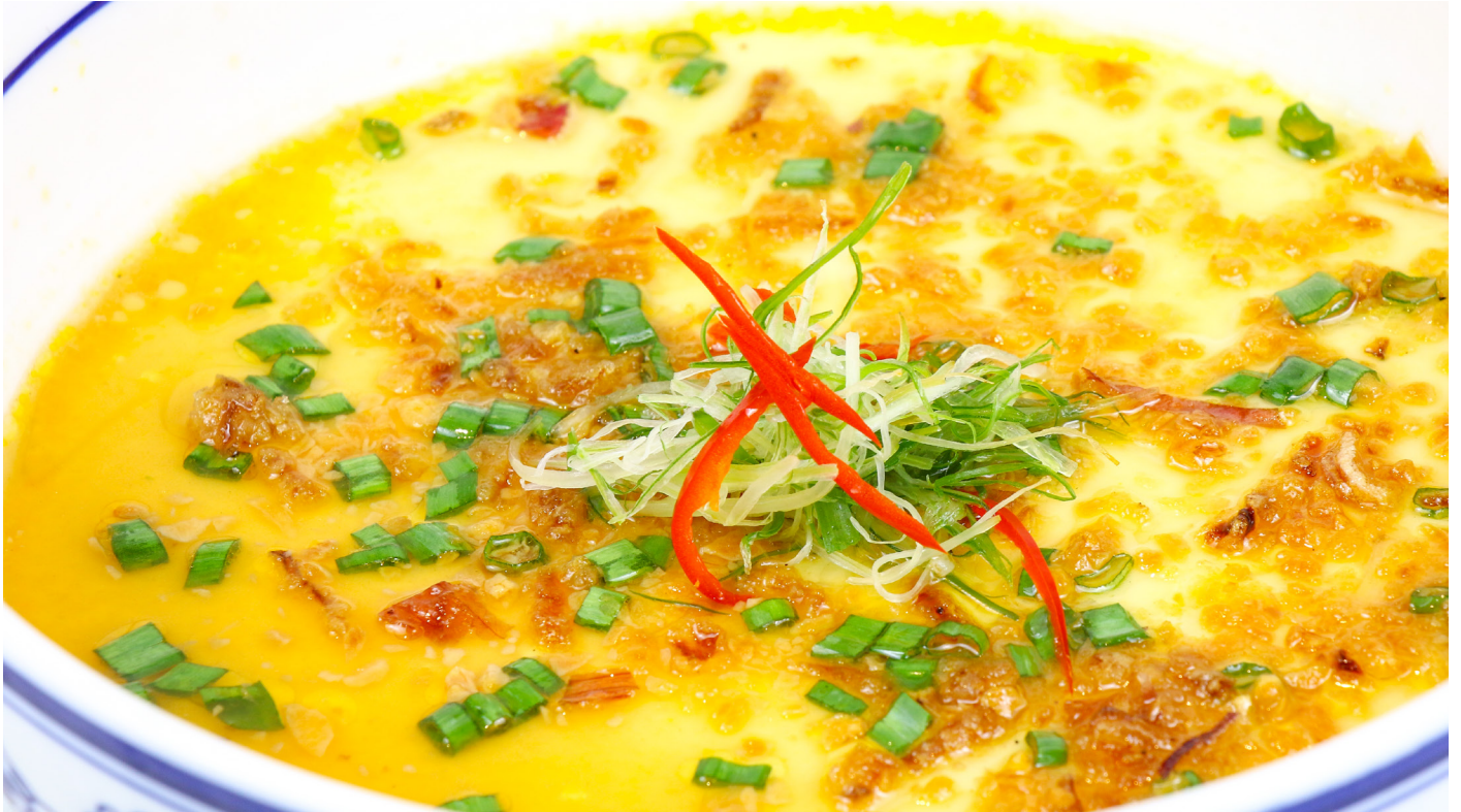
▲ E1. 蒸双簧水蛋 Superior Soup Twin Steamed Egg RM24.00