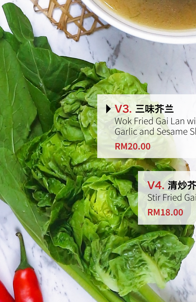
▶ V3. 三味芥兰 Wok Fried Gai Lan with Garlic and Sesame Shallot RM20.00