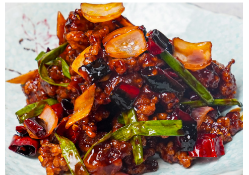
▲ PR10. 宫保虾羔肉 Kung Pao Mantis Prawn RM32.80