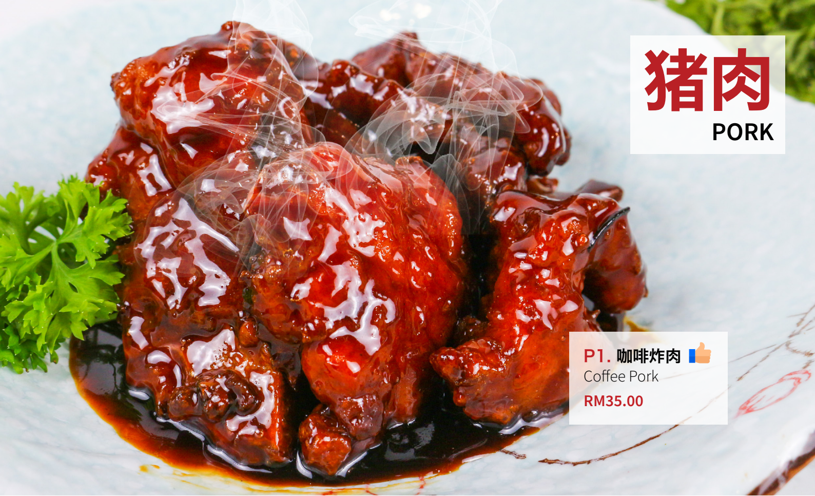
P1. 咖啡炸肉 🍷 Coffee Pork RM35.00