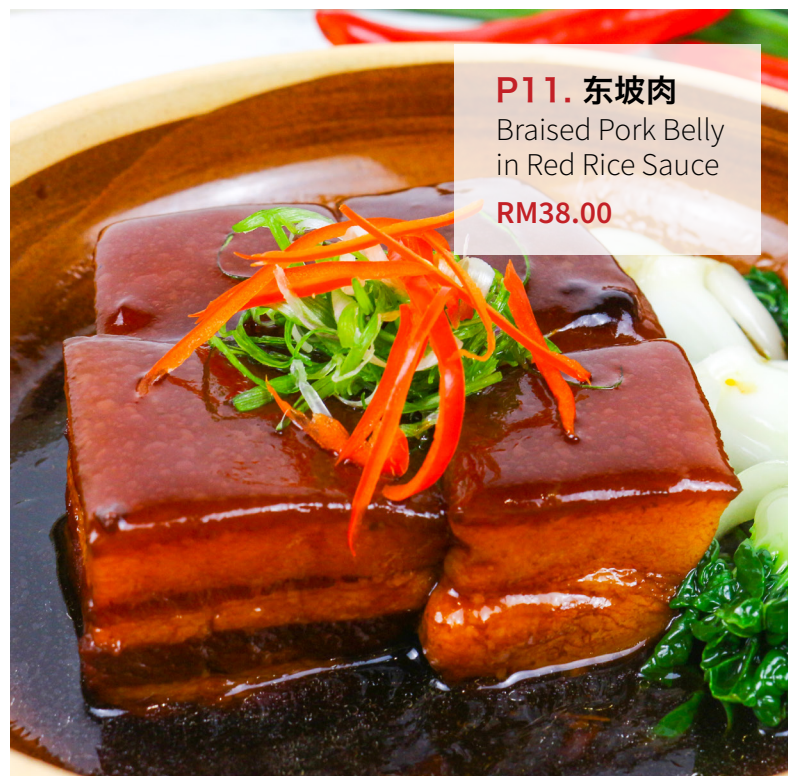
P11. 东坡肉 Braised Pork Belly in Red Rice Sauce RM38.00