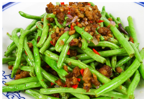
▲ V5. 肉碎四季豆苗 Stir Fried French Bean with Minced Pork RM28.00