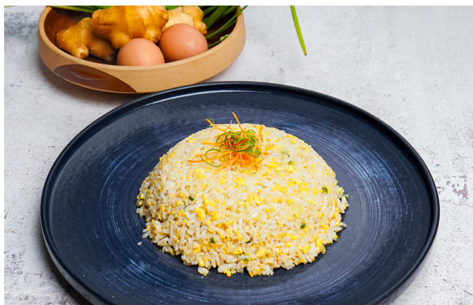
◀ R1. 姜蛋炒饭 Ginger Egg Fried Rice RM15.00