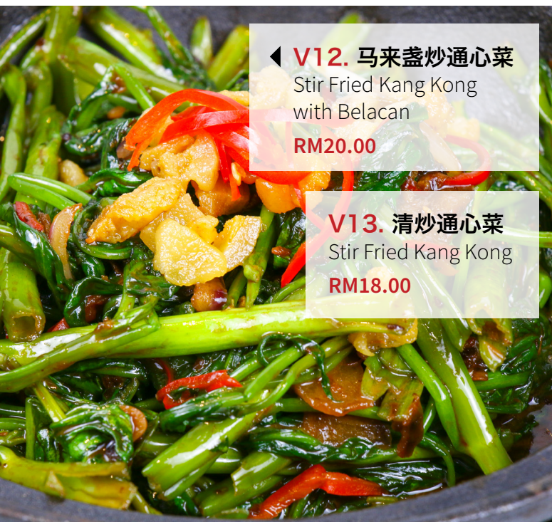
◀ V12. 马来盏炒通心菜 Stir Fried Kang Kong with Belacan RM20.00