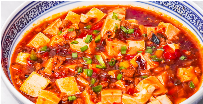
▲ BC2. 麻婆豆腐 Homemade Beancurd with Sichuan Style RM20.00