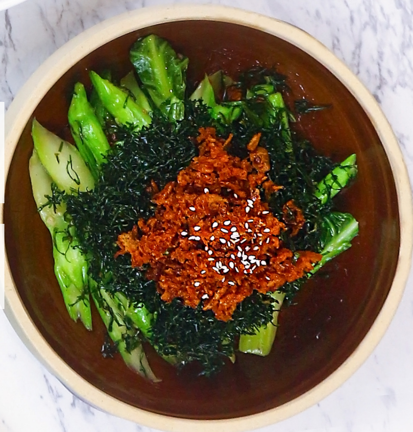
V4. 清炒芥兰 Stir Fried Gai Lan RM18.00