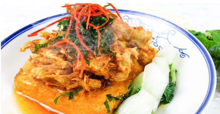
▲ BC4. 金针菇豆腐 Special Homemade Beancurd with Enoki RM20.00