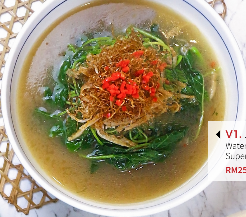
◀ V1. 上汤茼菜 Water Spinach in Superior Soup RM25.00