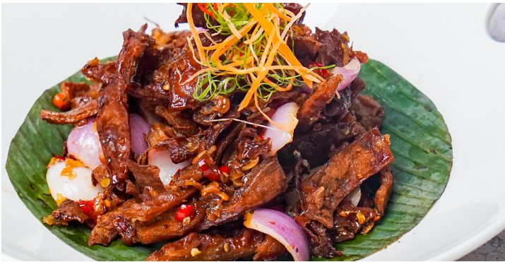
◀ P2. 虾米炒大肠 Stir Fried Intestine with Dried Shrimp RM32.00