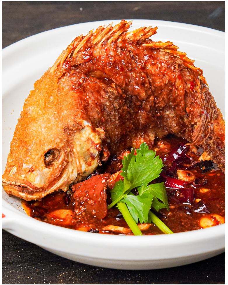
▲ F5. 潮州海脚煲 Teow Chew Dry Fish Pot RM78.00